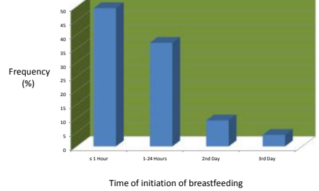
Fig 2: Bar chart showing the time of initiation of breastfeeding.

Twenty five percent of mothers gave prelacteal feeds and the reason for its use was attributed to lack of breast milk at the time. Only 1 attributed it to the effect of anaesthesia following a caesarean delivery. As at the time of the study, 49.5% of the babies were been optimally breastfed with a higher percentage (68.8%) among those who initiated breast feeding within the first hour of life. Optimal breastfeeding practice was significantly associated with the time of initiation of breastfeeding. Table 1