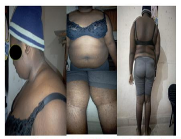
Fig. 1: L - R showing supraclavicular pad of fat; abdominal striae; hisutism and truncal obesity

She was counseled for possibility of renal transplant. She was discharged after stabilization to continue follow - up and was followed up at the Endo crinology and Nephrology clinics, however, she was lost to follow-up.