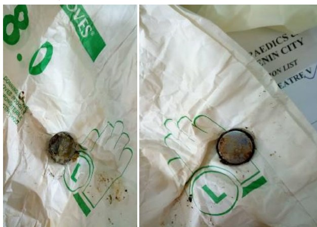
Fig 3 and 4. Anterior and posterior surfaces of the corroded disk battery retrieved.

Four hours post op, he developed stridulous breathing with drooling of saliva. A three day course of intramuscular dexamethasone at 0.15mg/kg/dose 8hourly was administered. Symptoms resolved within 24 hours. Nasogastric tube feeding was commenced four days post operatively and this was well tolerated.